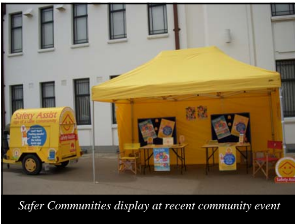
Safer Communities display at recent community event

SINCE OUR NEW ORGANISATION, Safer Communities Australia Inc, was launched in 2003, we have been building up our resources to assist us in spreading safety messages throughout communities.